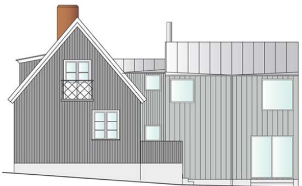
FASAD MOT VÄSTER